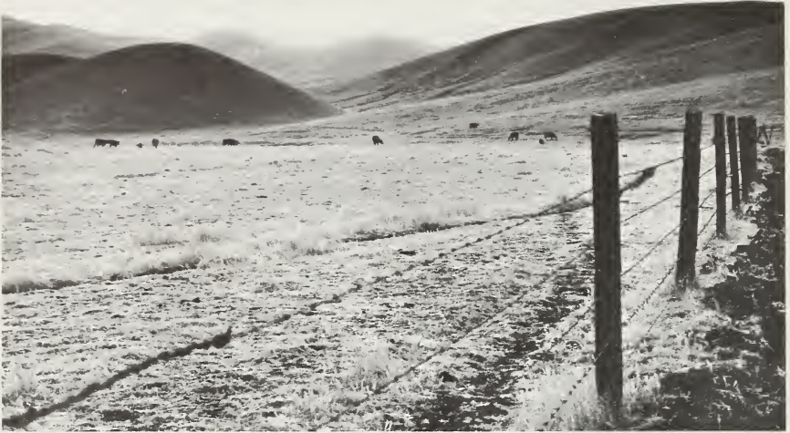
Fig. 6. Typical Coast Range feeding habitat for California condors.